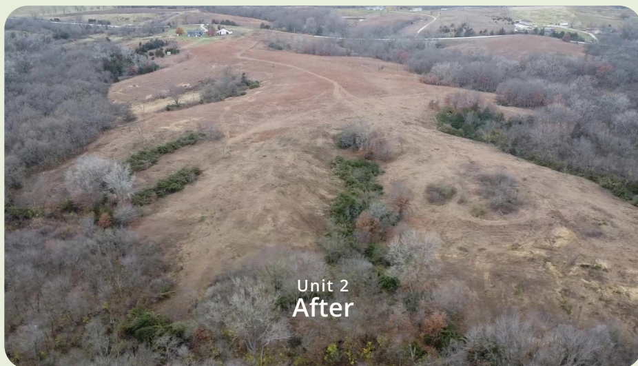
Unit 2 After

Scan the QR Code to see the drone footage of the entire Medora Prairie project!