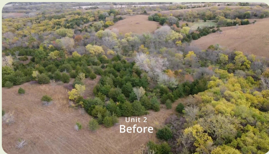
Unit 2 Before

We would like to again thank the U.S. Fish and Wildlife Service for this partnership and are looking forward to future projects.