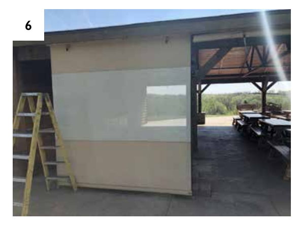
6. Unroll the panell