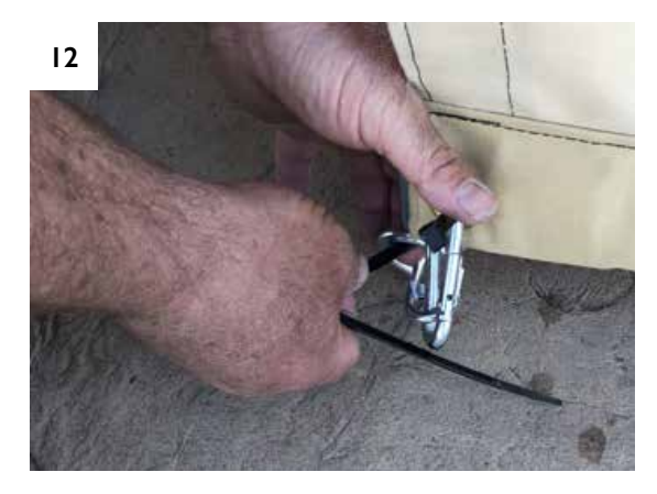
12. Thread the zip tie through the grommett and the eye-bolt.