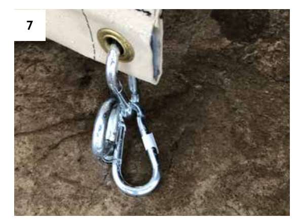
7. The lower corners of each panel have two carabiners attached to the grommet. These carabiners are to be left attached to the panels at all times.