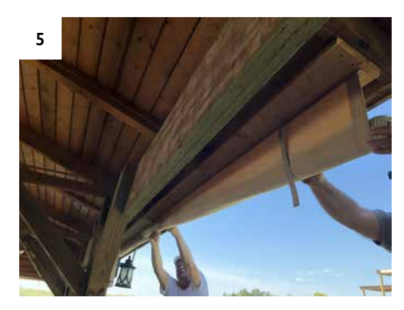
5. Unroll the panel.

NOTICE: By choosing to lower the Davison Pavilion wall panels, you acknowledge that you will follow these usage guidelines and that you accept financial responsibility for any damage resulting from said use.