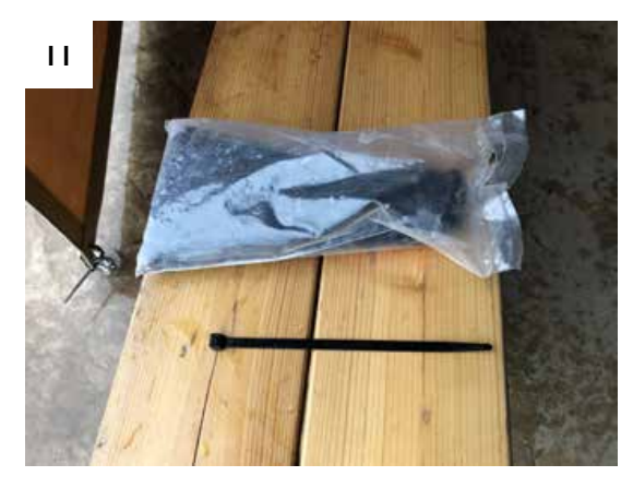
II. Use the provided zip ties to tighten the panels between the lower grommets and the eye-bolts in the floor anchors.

NOTICE: By choosing to lower the Davison Pavilion wall panels, you acknowledge that you will follow these usage guidelines and that you accept financial responsibility for any damage resulting from said use.