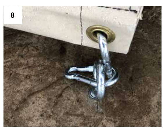
8. Hook the lower carabiner through eye-bolt in the floor anchor.