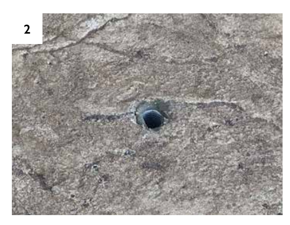
2. Locate anchor holes in the LDMP floor at both ends of every panel you are going to lower. Adjacent panels share anchors.