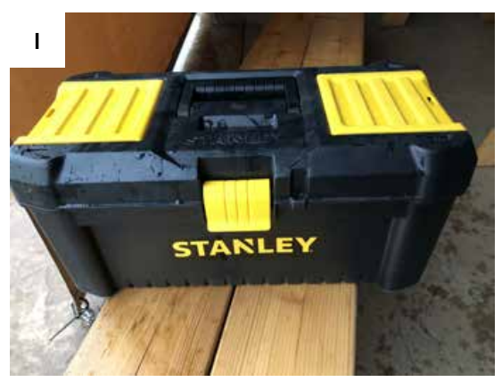
I.All needed tools and hardware for using the wall panels are located in this box, kept in the Lester Davison Memorial Pavilion (LDMP) utility room. Your rental key will unlock the utility room door. Ladders are also provided and MUST be used when lowering and raising panels.

NOTICE: By choosing to lower the Davison Pavilion wall panels, you acknowledge that you will follow these usage guidelines and that you accept financial responsibility for any damage resulting from said use.