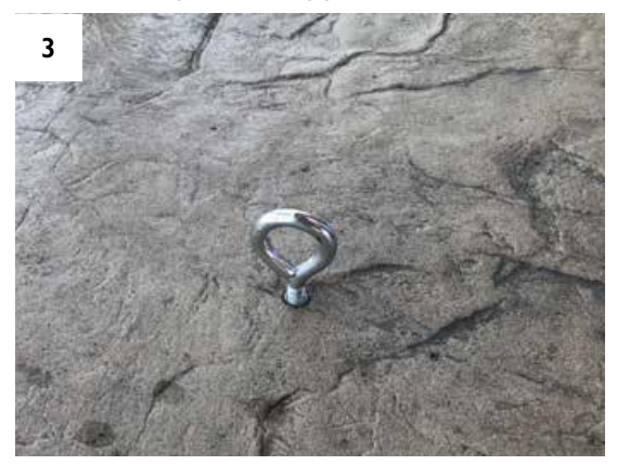
3. Thread eye-bolts into anchor holes in the LDMP floor at both ends of every panel you are going to lower. Thread bolts completely into anchor holes—hand tight only. Adjacent panels share anchors.