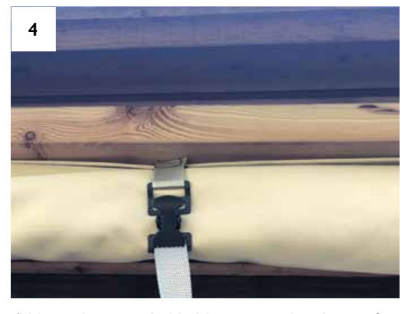
4. Using the provided ladders, open the clasps of the first panel being lowered. This works best as a two-person operation.